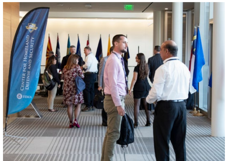
The Education Summit provides excellent opportunities to expand your network | UAPP 2019