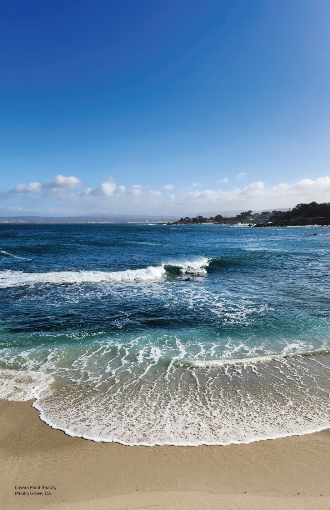
Lovers Point Beach, Pacific Grove, CA